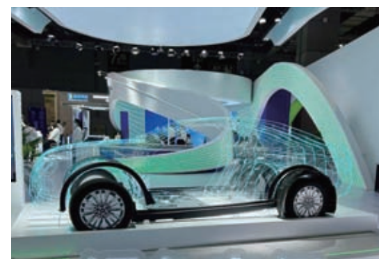
Green transportation is a major theme at the Expo. — Zhu Shenshen